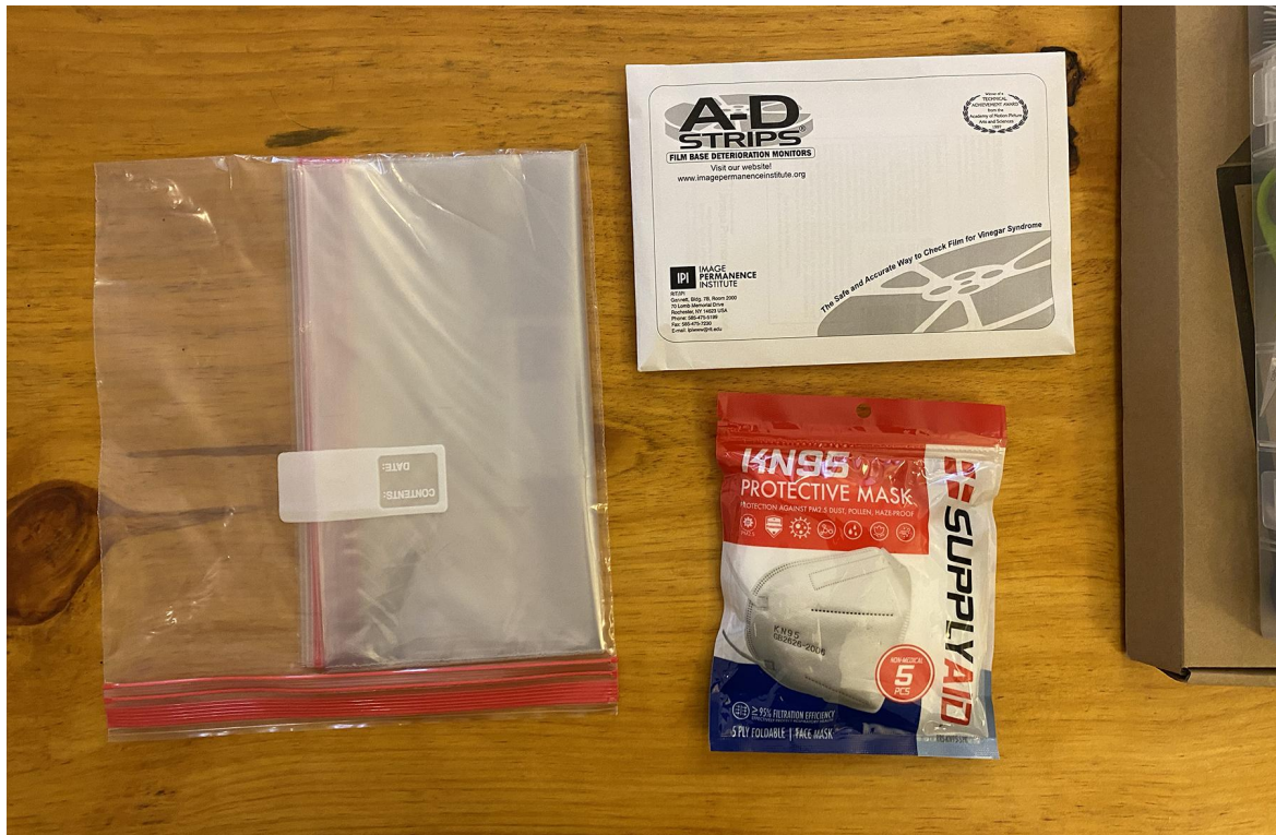
Ziplock bags, AD Strips, KN95 masks (above)